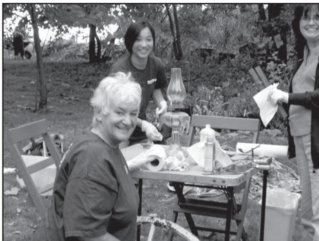
Volunteers from Kohl's cleaning the tool shed.

Kohl's department store has a corporate initiative to promote volunteerism and support organizations that benefit children. They have not only sent out hard working volunteers to work on gardening and cleaning our 19th century tool exhibit, but also donate money to be used for educational purposes for every five employees who volunteer their time.